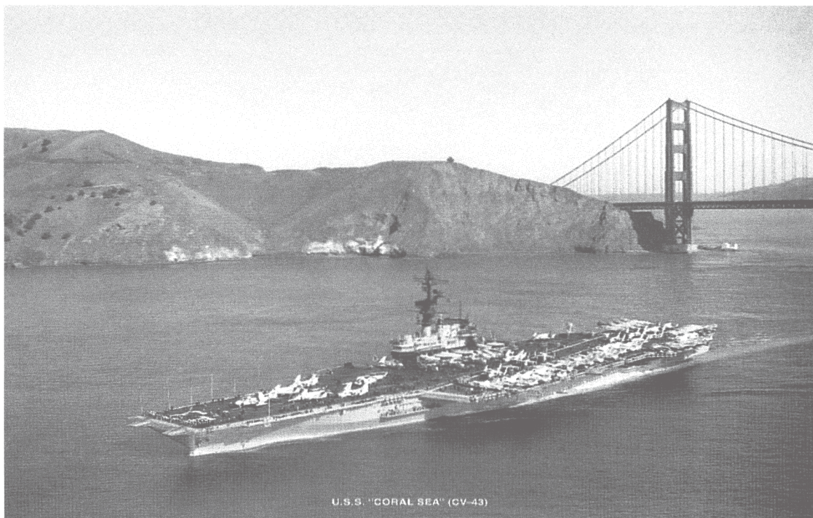
U.S.S. "CORAL SEA" (CV-43)