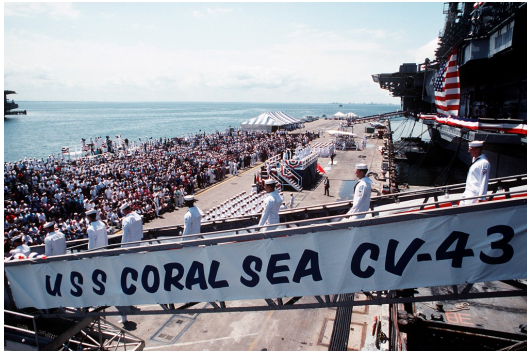
Apr 30, 1990 - Crew members file down the gangway during the decommissioning ceremony for the aircraft carrier USS Coral Sea (CV-43).

Enemy losses in the Battle of the Coral Sea included 100 planes, 15 ships sunk—including the aircraft carrier Shoho—three heavy cruisers, one light cruiser, two destroyers, two ships severely damaged and probably sunk (one cruiser, one destroyer),