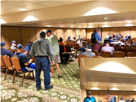
Coral Sea Assoc. members enjoy some "catch-up" time with each other prior to the start of the annual reunion business meeting.

one of those times! Even with 'business' at hand, the atmosphere is welcoming and low-key.