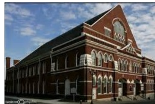
Stops will The Ryman Auditorium is known as the "mother include Music church" of country music and original home of the Grand Ole Opry.

tion, and faithfully recreating the appearance of the original in Greece.