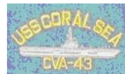
Ship's Logo CVB, CVA, CV