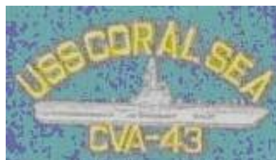
Ship's Logo—CVB, CVA, CV