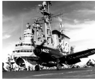
Flight Ops from the early years.

year old kid from a small town in Texas. I can still see her in my mind's eye from the ferry that ran between Seattle to Bremerton. She had no super structure. Her flight deck was bare, except for construction shacks. It