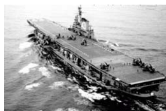
CV-43...the journey begins: Underway 10 Dec. 1947.