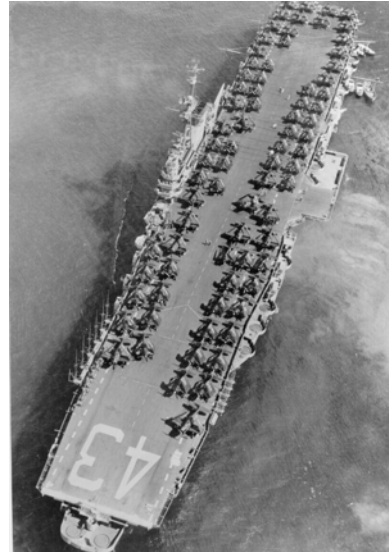
USS Coral Sea at Gitmo in 1947.